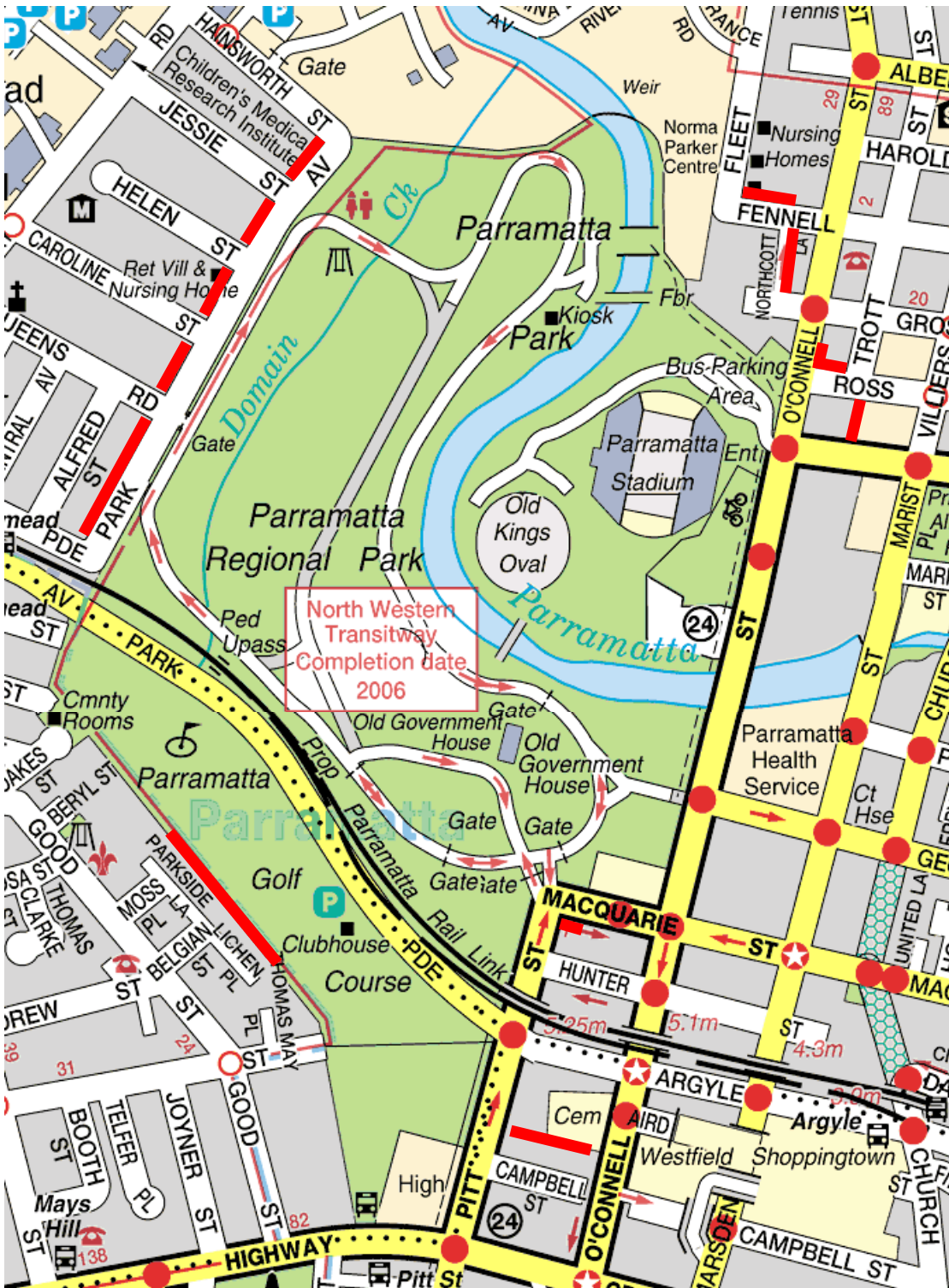
Locations of noise measurements along residential boundaries, as marked with red lines ( — ).